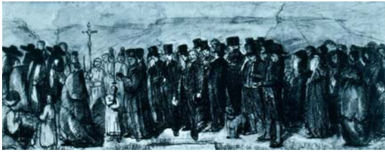
Fig.3: Funeral at Ornans, Gustave Courbet

"Our living conditions and methods of construction must be fully and completely expressed if architecture is not to be reduced as caricature. The realism of our time must pervade the developing work of art. It will not harm it, nor will any decline of art ensue as a consequence of it; rather it will breathe a new and pulsating life into forms, and in time conquer new fields that today are still devoid of art- for example that of engineering."