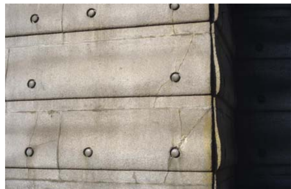
Fig.7: Post Office Savings Bank- Corner Detail

This reduction of a monumental structure to a more minimalist one accounts for a particularly unique architectural expression that seems to take Wagner back to his symbolist roots. It is interesting to note that Neumeyer finds a contemporary counterpart in the work of Tadao Ando where the holes left by concrete formwork allow for "...light itself to become a substitute for the revealing veil of a material layer." 15