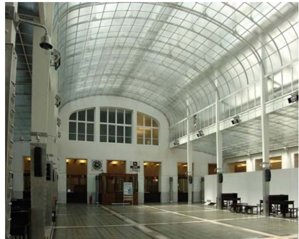
Fig.4: Post Office Savings Bank- interior, main hall

Wagner entered into a competition in 1903 and was selected among 37 participants to design the new building for K.K. Postsparkassenamt (also known as Postal Savings Bank) in the significant Ringstrasse area of Vienna. The building is a reinforced concrete structure faced outside with marble and granite slabs, fastened with aluminum capped iron bolts. Entrance canopy, balconies and roof and cornices are also made of aluminum. The interior facades are covered with tiles and the main court is roofed over with a steel and glass structure creating the central hall (See Fig.4).