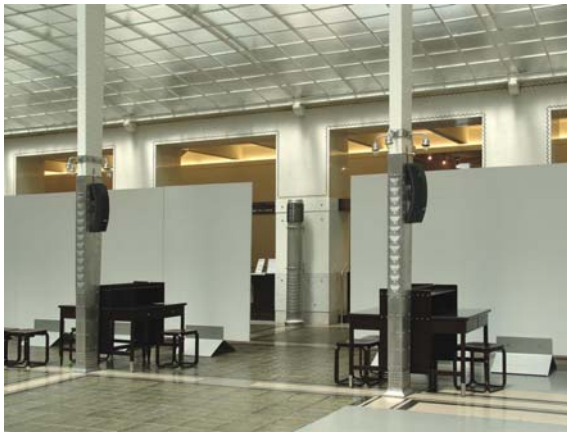
Fig.5: Post Office Savings Bank- interior view

"The famous banking hall of the Postsparkasse has altogether 'interiorized' the station building and its large glass-covered space with a type of construction that seems to be inspired by the suspension bridge. The section cut through the main hall, with the ocular positioning of the circular lamps, even suggests the illusion of a locomotive on rails. The station building and the bridge, both prominent issues in Wagner's urban architecture, reoccur, but this time they are hidden behind walls." 14