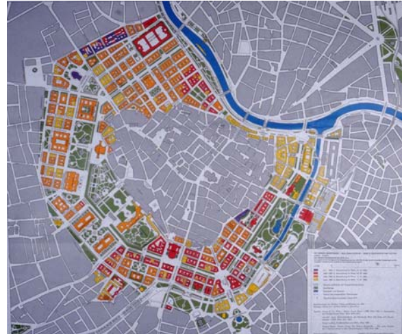
Fig.1: Vienna – Ringstrasse Map

furnished important symbols of aristocratic values that linked the liberal bourgeoisie to the ruling class of the Habsburg Dynasty, the history of which in Austria extended back to the thirteenth century." 5