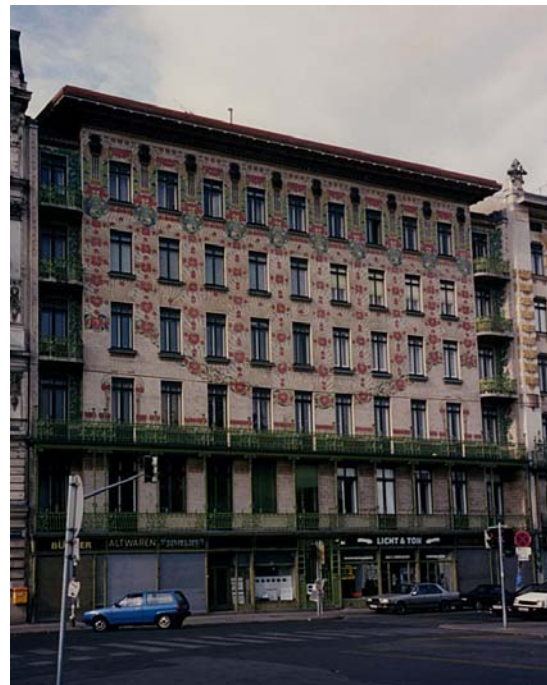
Fig.2: Majolica House, Otto Wagner

members, Wagner is widely recognized as a significant member of the movement along with Gustav Klimt, Joseph Maria Olbrich and Josef Hoffmann. The Majolica house (See Fig.2) is a significant in this period with its flowery motifs and decorative use of iron. The composition seems to emphasize on the structural arrangement behind the façade. This convergence of novel material application and new stylistic motifs expressed by the secessionists implied a deeper ideological context that was built up over time and negates the conventional 'break with history' explanation for the rise of modern architecture.